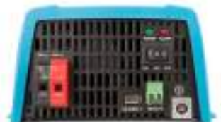
Inverter 12/375 VE.Direct