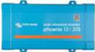
Inverter 12/375 VE.Direct